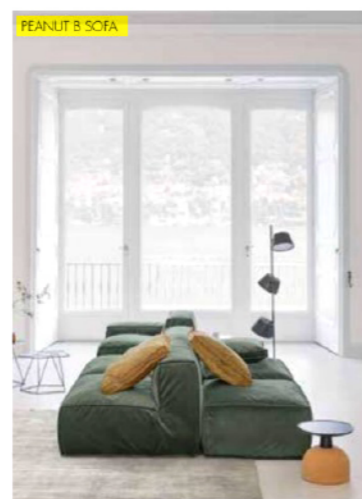
PEANUT B SOFA