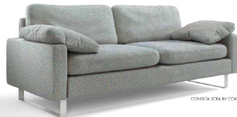
CONSETA SOFA BY COR

And no matter what your wind-down ritual might look like, we believe there is no finer platform for indulging it than the modern designer sofa — an island of unparalleled tranquillity. And the space on which every Sunday should unfold. Here, we've collated seven of the finest examples; each of which promises to change the way you live and lounge.