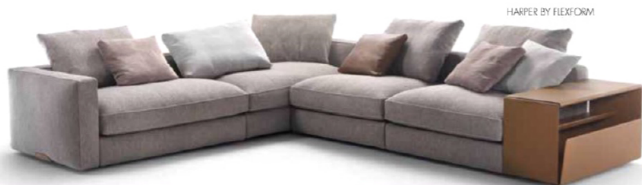
HARPER BY FLEXFORM