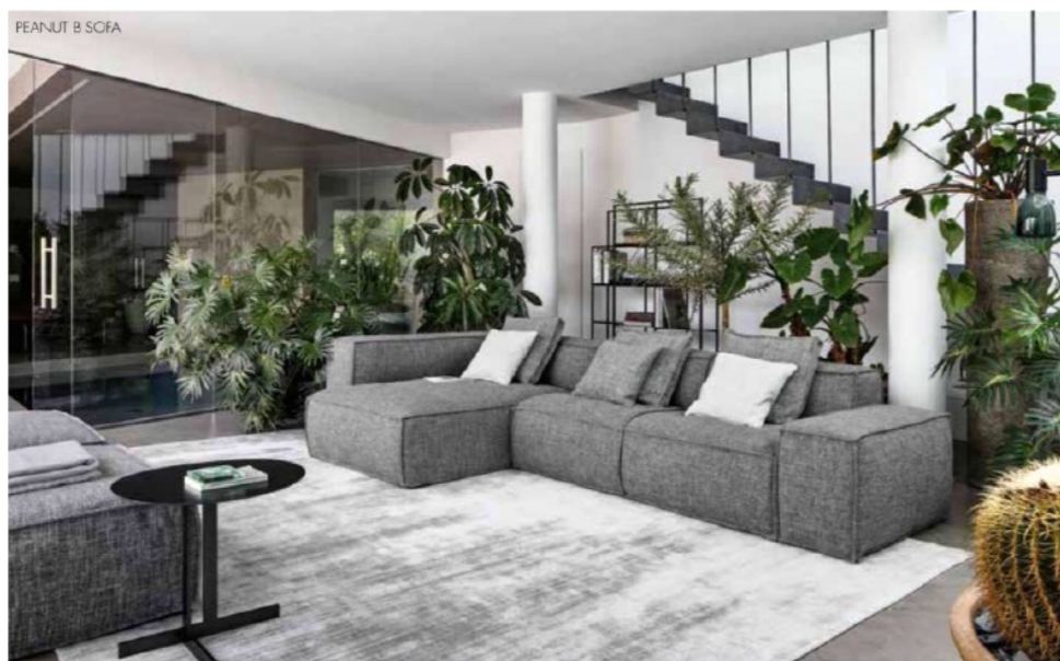
PEANUT B SOFA

F ew moments are more sacred to the modern aesthete than the after-dinner flop — the joyous, somewhat giddy moment that comes when we finally retire from our duties for the day.