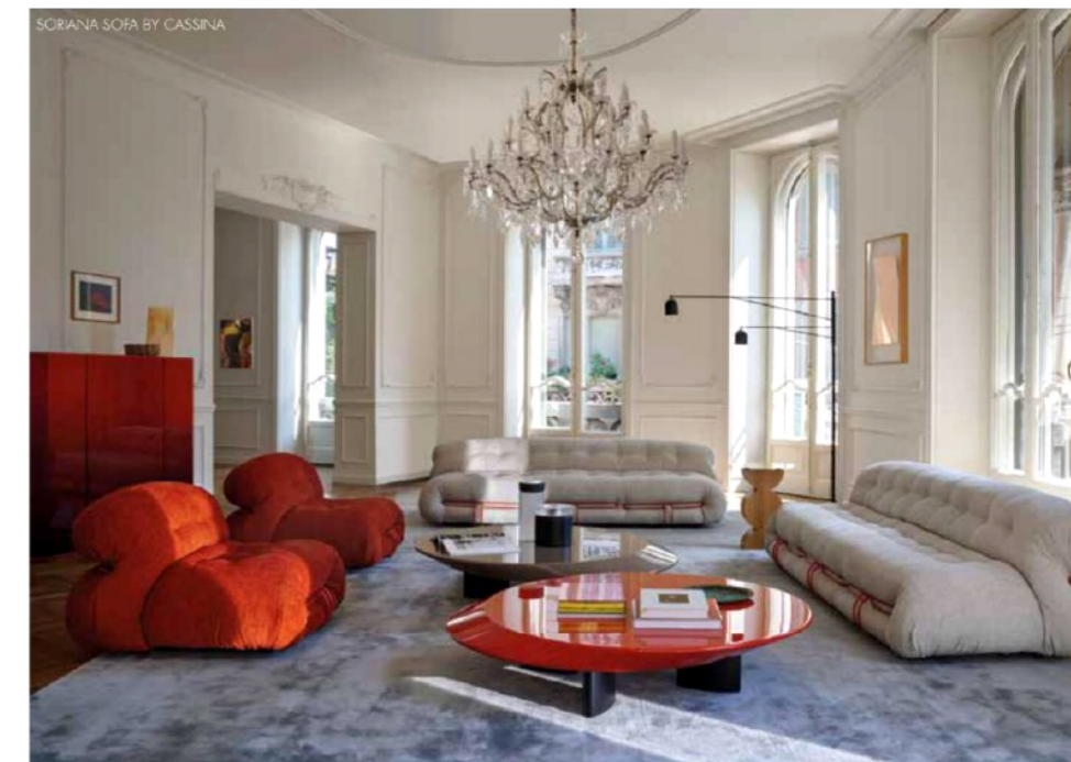
SORIANA SOFA BY CASSINA

Chaplins Furniture 477-507 Uxbridge Road HA5 4JS 020 8421 1779 chaplins.co.uk