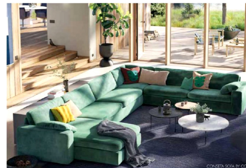
CONSETA SOFA BY COR

A true all-rounder, Peanut B promises to establish a new lexis of comfort for modern homes. One that can be loved, lived and made your own.