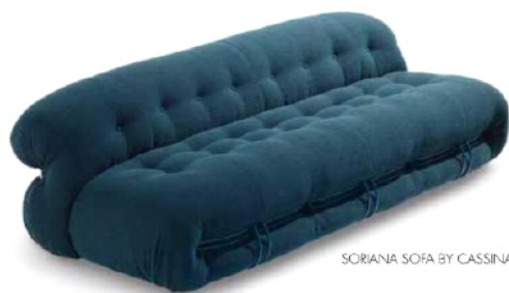
SORIANA SOFA BY CASSINA